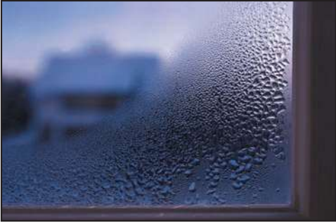
Condensation on the inside of a window-pane.

■ Keep indoor humidity low. If possible, keep indoor humidity below 60 percent (ideally between 30 and 50 percent) relative humidity. Relative humidity can be measured with a moisture or humidity meter, a small, inexpensive ($10-$50) instrument available at many hardware stores.