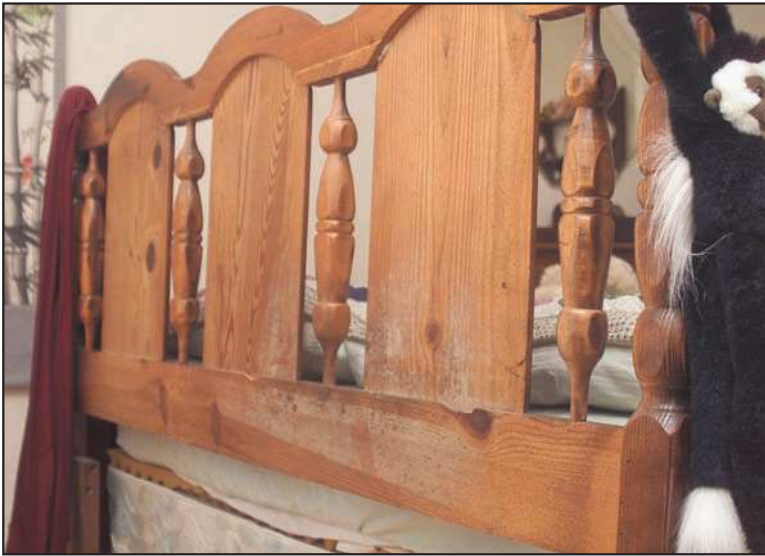
Mold growing on a wooden headboard in a room with high humidity.